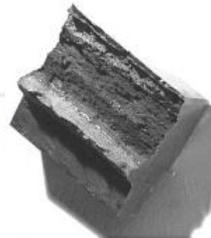
Fig.2 Appearance of fracture face