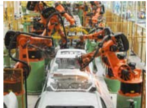
Industrial robots welding a car body in a production line