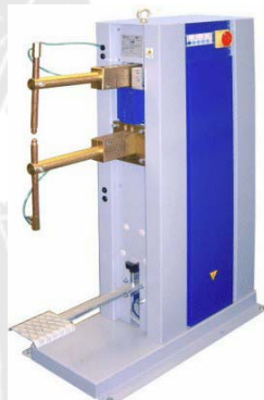
Migtagarc- Copyright 2003