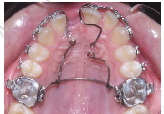
Dental prosthesis (orthodontics)